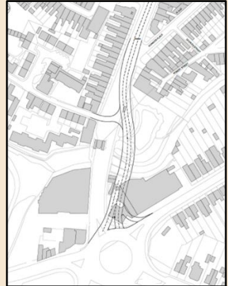
Proposed new highway into Lynn

The whole of the Hardwick area is now devoid of any character . Drivers approach the town through a morass of anonymous sheds and garages that could be anywhere. No wonder so many people give it a wide berth. But arriving through the Southgates drivers leave the commercial sprawl and enter a perfect Georgian street. It is like raising the curtain on a play. Arriving through the medieval gate sets the tone for the town , sets it apart from other faceless places.